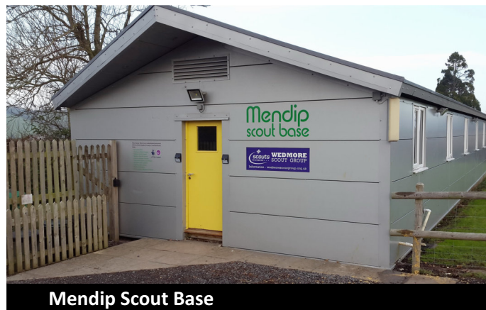
Mendip Scout Base

Wedmore has many fine old buildings, including a 12th-century church; as well as a 'Village Store' that sells a wide range of products, produce and 'goodies'. It is where King Alfred signed a peace treaty with the Danes in AD 878, following their defeat at the Battle of Ethendune.